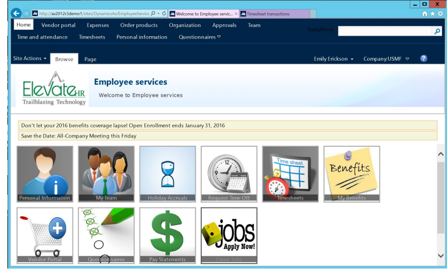
Elevate HR's updated self-service user experience delivers Microsoft's Modern UI within the framework of Enterprise Portal

Manager Self-Service, our HCM Effectiveness* module on the Enterprise Portal, gives HR departments flexible, powerful, easy-to-maintain Process Wizards which distribute HR processes to decision makers. Wizards can include manager-initiated change requests for actions such as compensation increases, promotions and transfers, hires and terminations, and requisitions for new positions and recruitment projects.