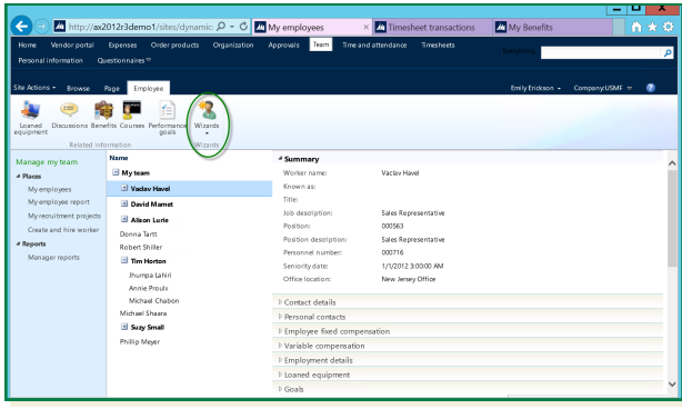
Drill down through multiple levels of your reports-to hierarchy, and launch Manager Self-Service by clicking the "Wizards" icon